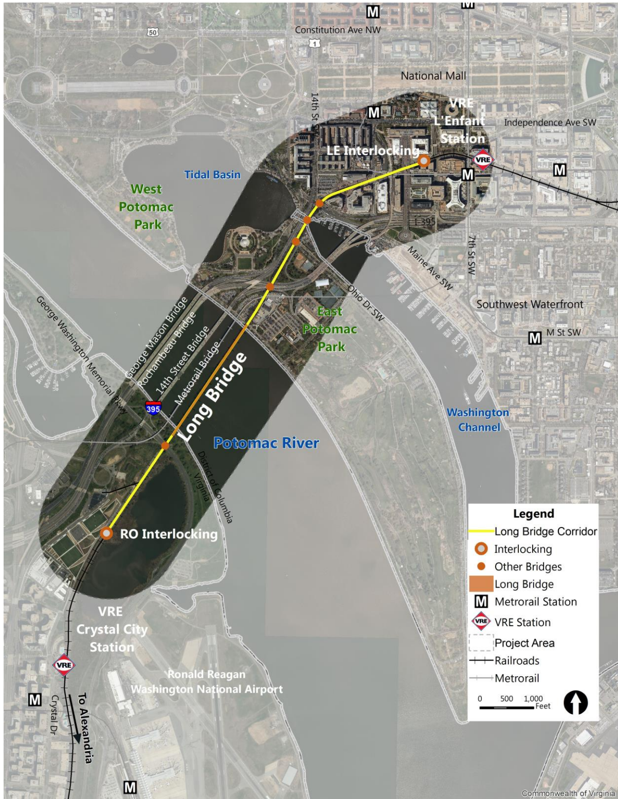
Figure 1-1 | Long Bridge Corridor Map