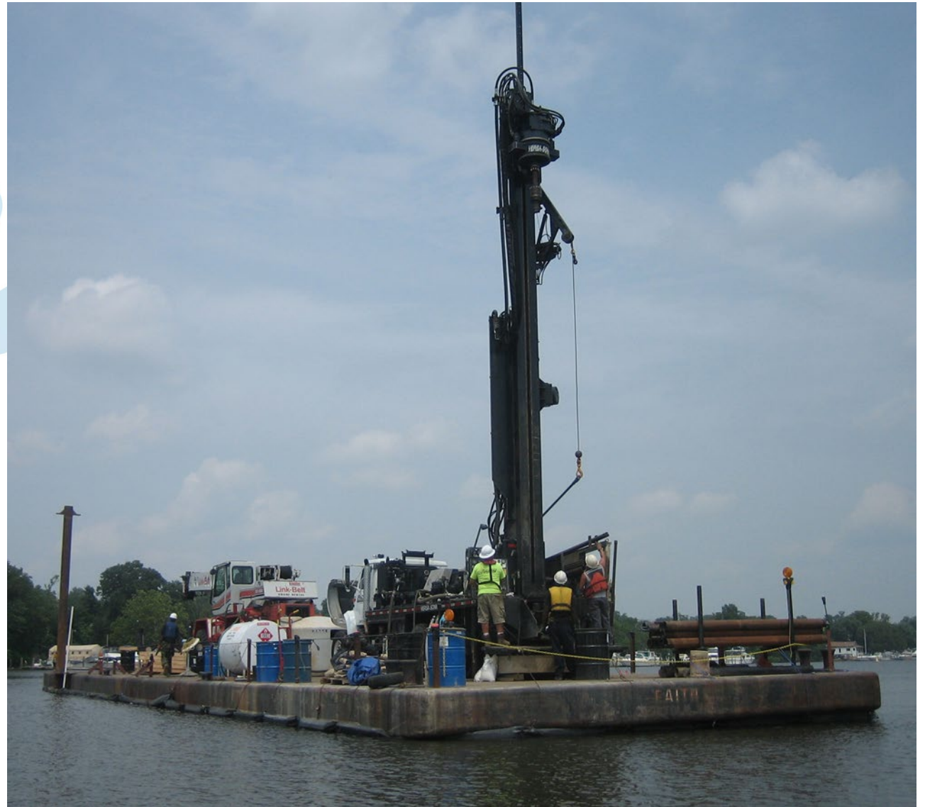
Soil Boring Sampling in Potomac River