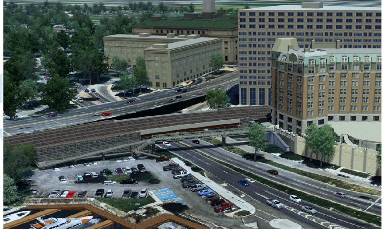
Visualization of New Rail and Pedestrian Bridges over Maine Ave., SW in Washington, DC