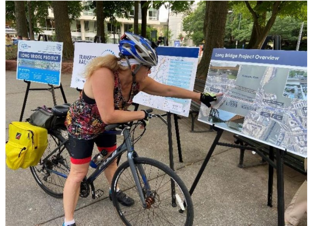
Public Outreach at Southwest Duck Pond Park in Washington, DC (June 2022)