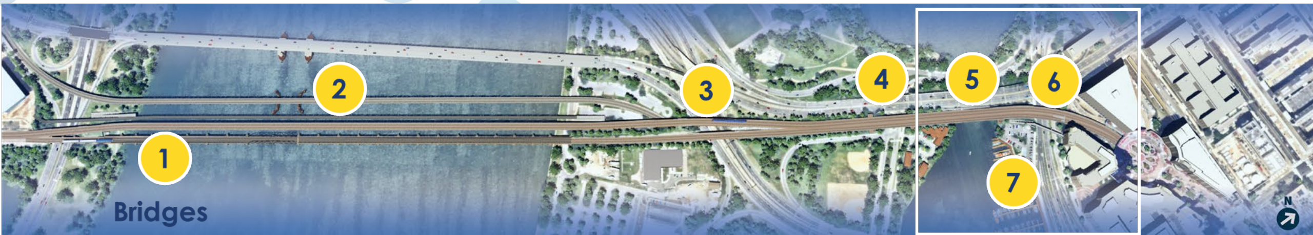
Project Map – Bridges