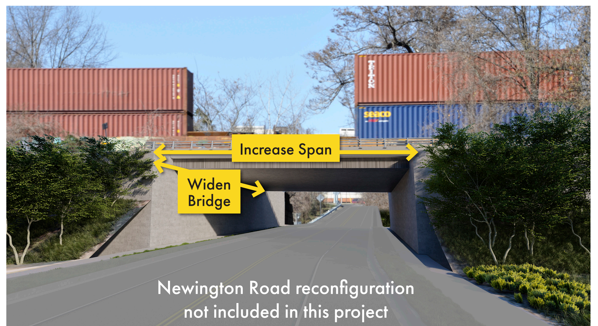
Planned railroad bridge over Newington Road (replacement)