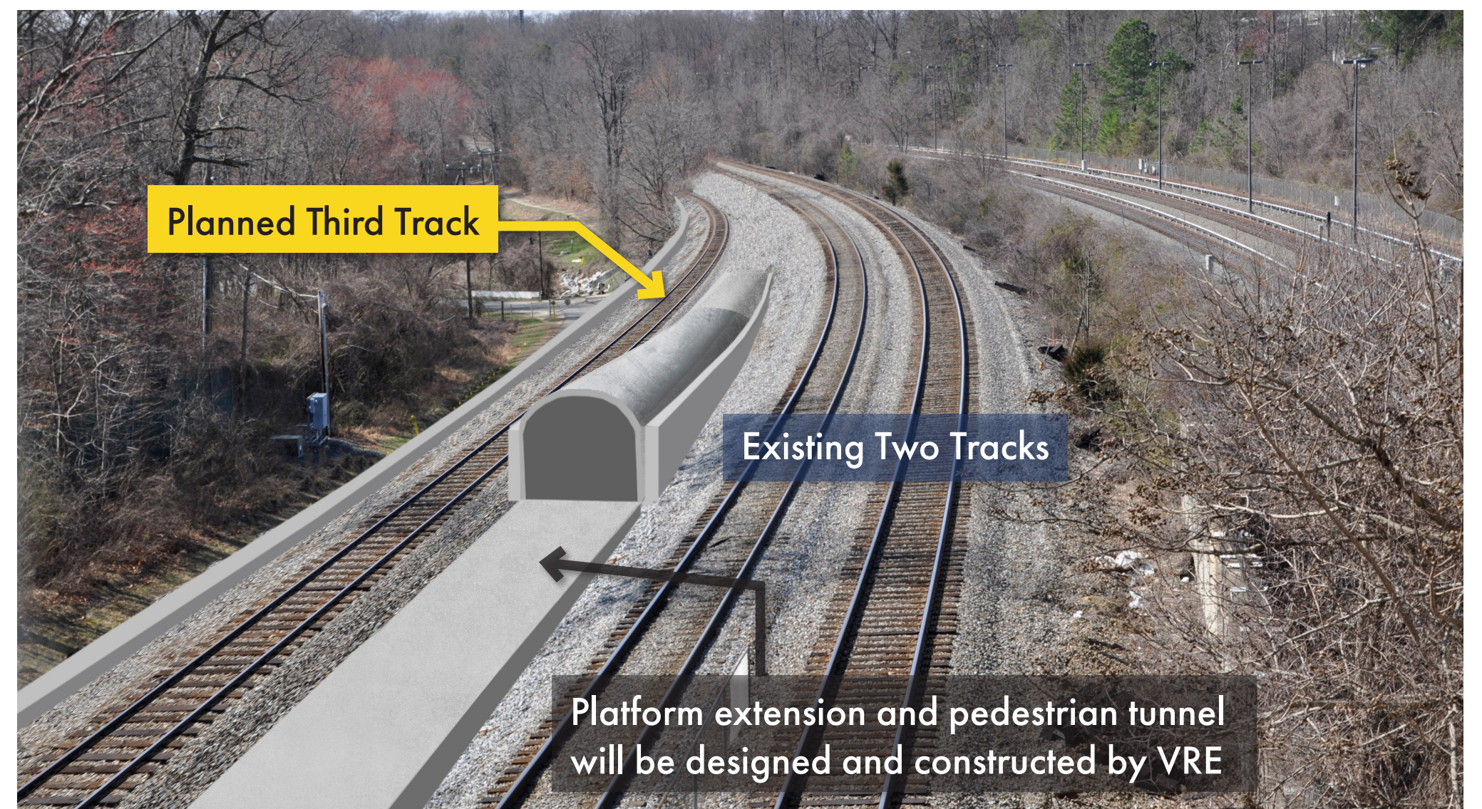
Planned additional third track