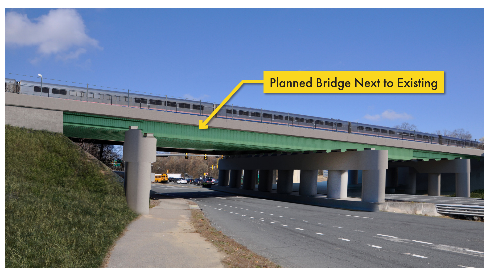
Planned railroad bridge over Lorton Road next to existing bridge