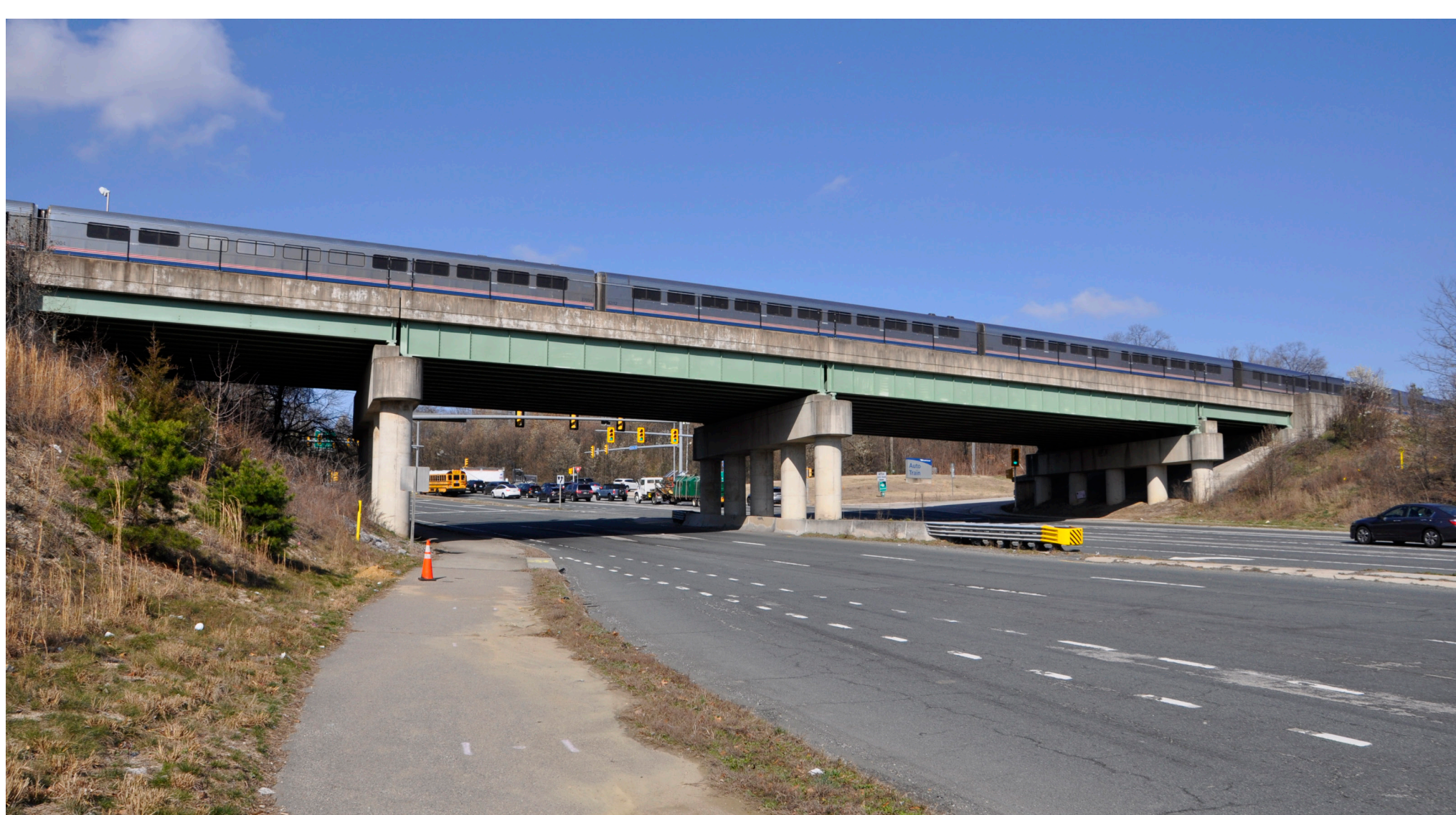
Existing railroad bridge over Lorton Road