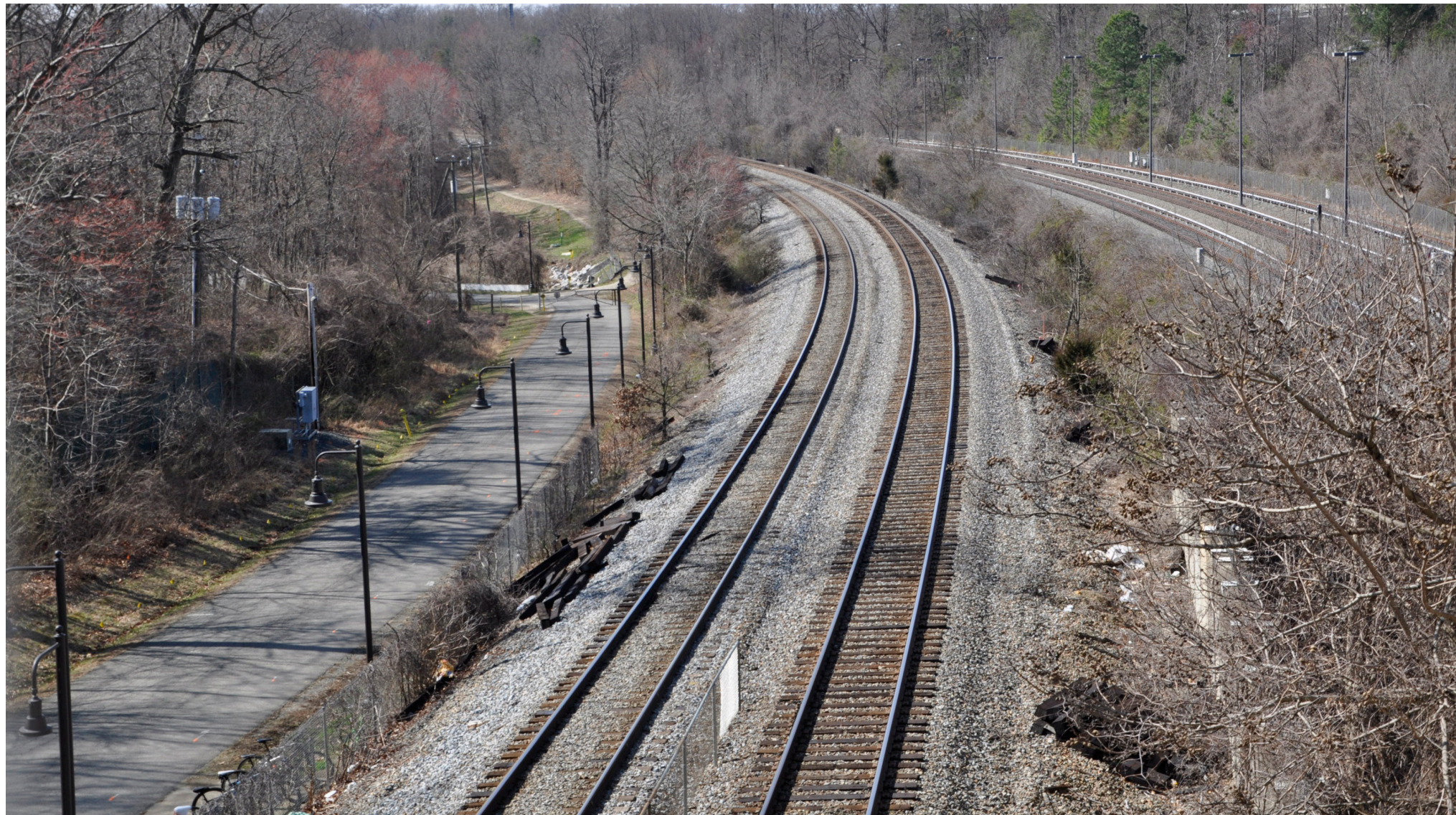
Existing rail corridor looking south from Franconia-Springfield Station