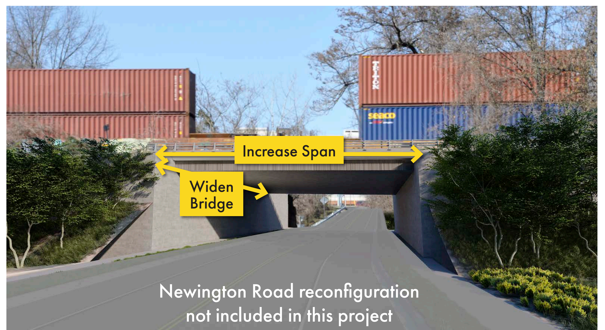
Planned railroad bridge over Newington Road (replacement)