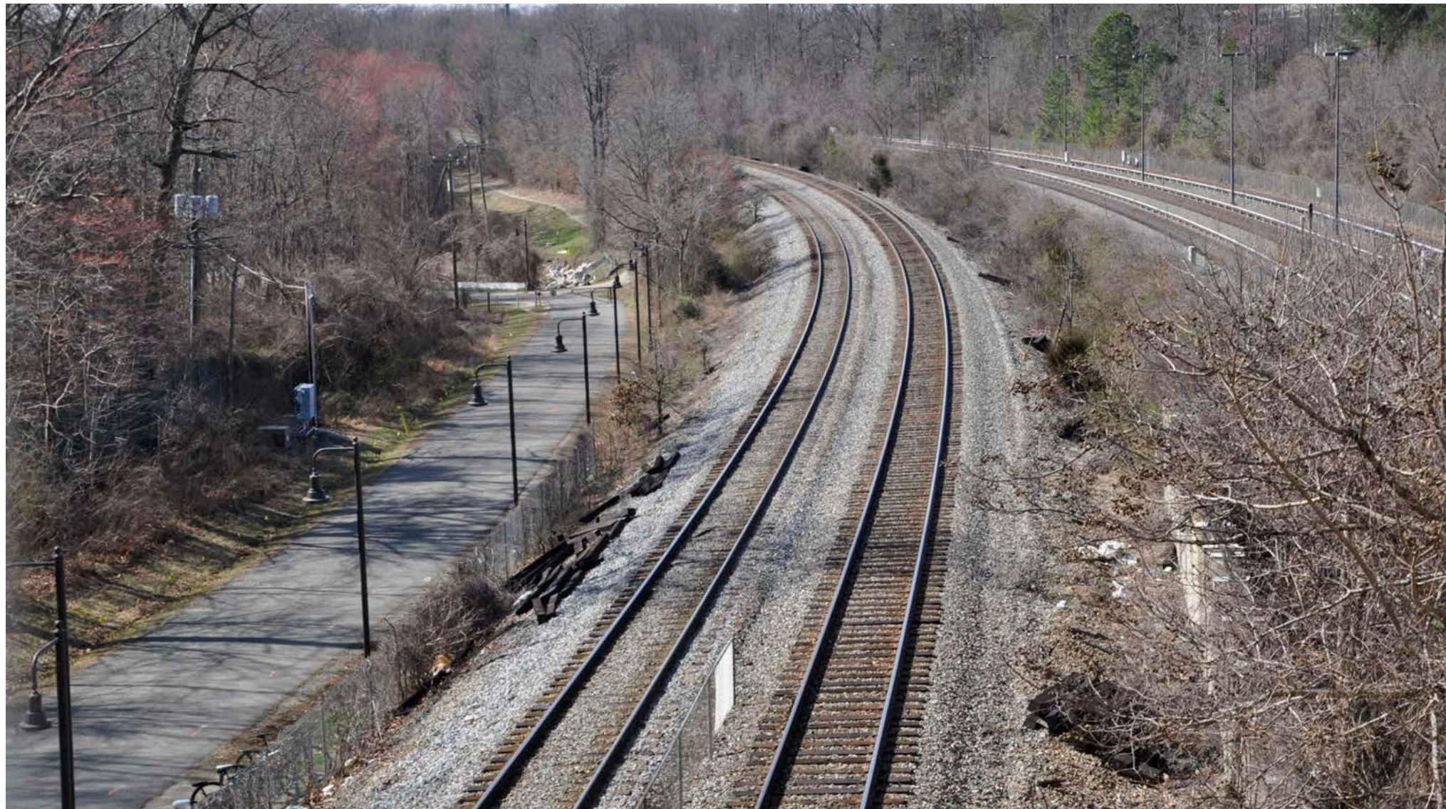
Existing rail corridor looking south from Franconia-Springfield Station