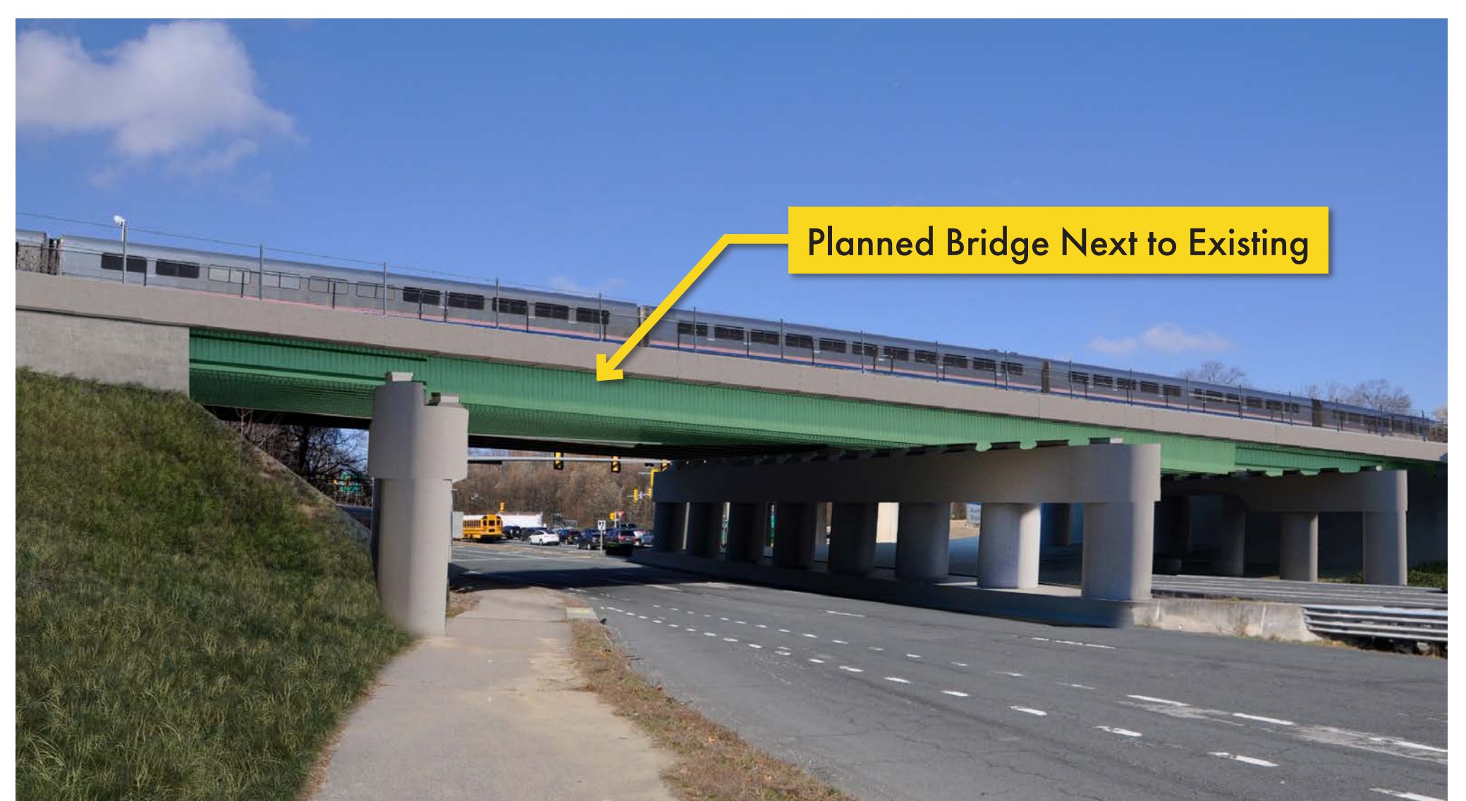
Planned railroad bridge over Lorton Road next to existing bridge