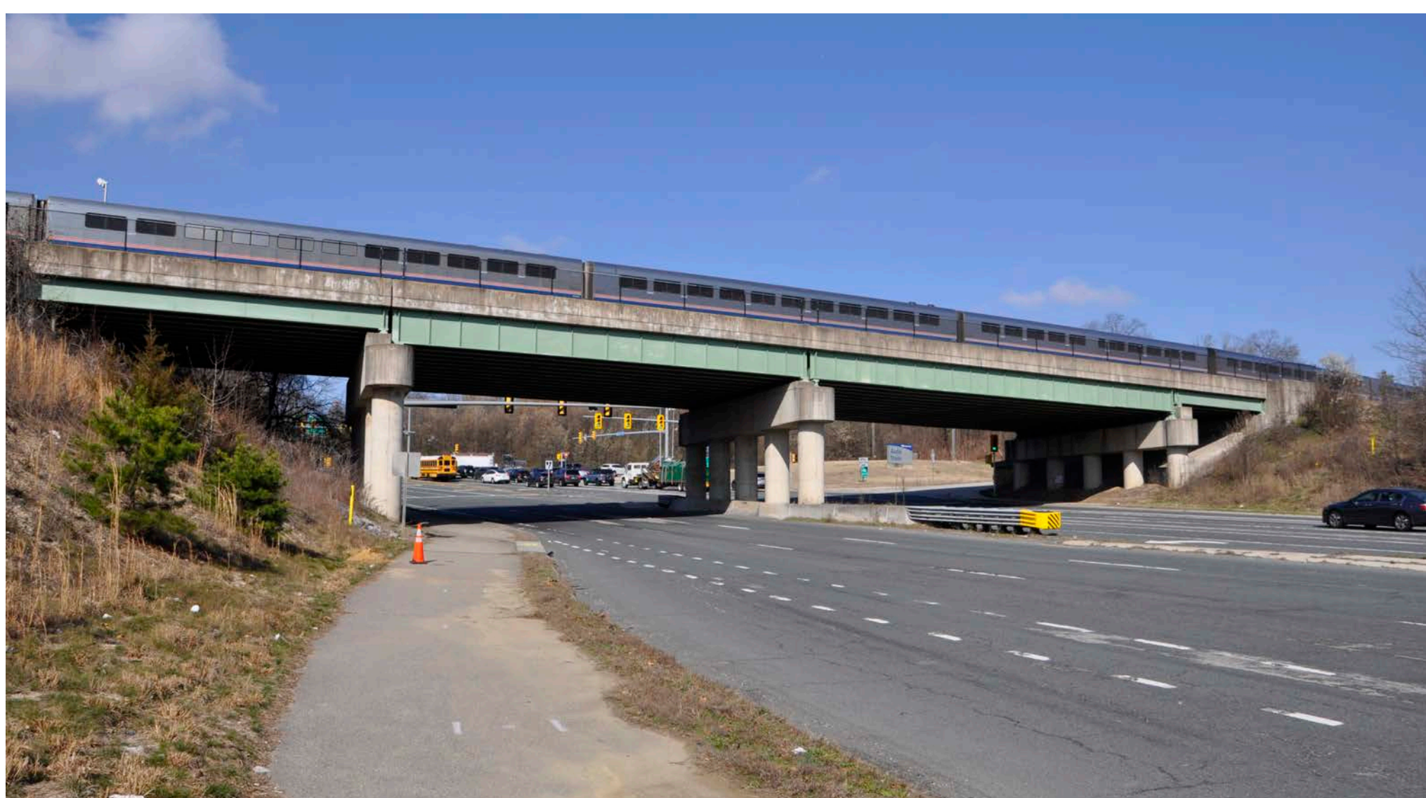
Existing railroad bridge over Lorton Road