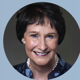
THE HONORABLE SHARON BULOVA