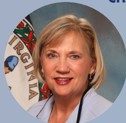
THE HONORABLE THELMA DRAKE