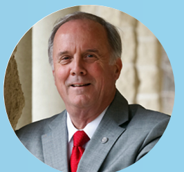
THE HONORABLE JOHN WATKINS