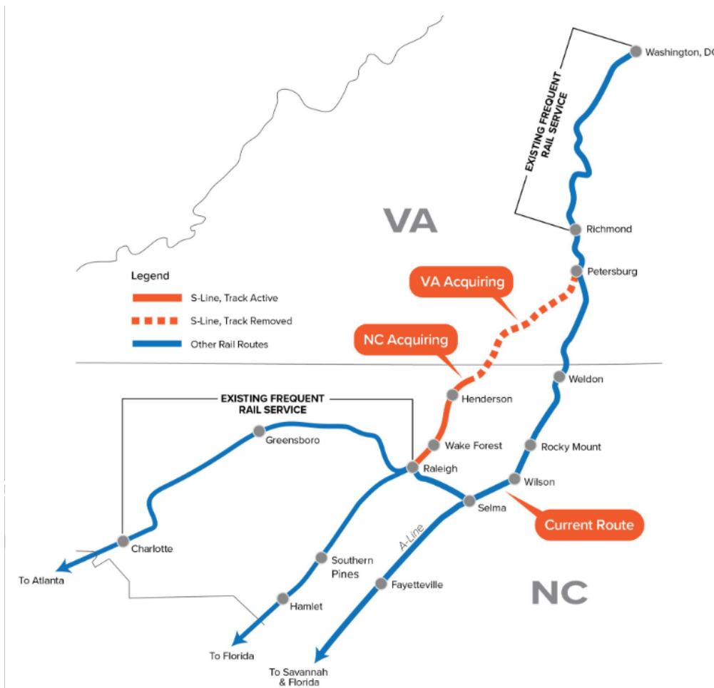
FIGURE 1 – R2R AND OTHER RAIL CORRIDORS IN NORTH CAROLINA AND VIRGINIA

Petersburg, VA, to Richmond, VA, a total length of approximately 162 miles (Figure 1). Within the R2R Corridor, the S-Line runs in a north-south direction roughly paralleling interstates I-85 and I-95.