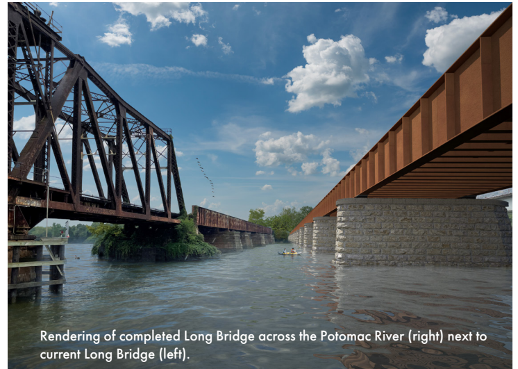
Rendering of completed Long Bridge across the Potomac River (right) next to current Long Bridge (left).

The existing Long Bridge is owned and operated by CSX Transportation (CSXT). The bridge operates at 98% capacity with nearly 80 CSXT, Amtrak, and VRE trains crossing it daily – carrying up to 1.3 million Amtrak passengers and 4.5 million VRE commuters annually. The new rail bridge will unclog this major transportation bottleneck between the north and southeast regions of the United States, improving reliability and growing the nation's passenger and freight rail networks.